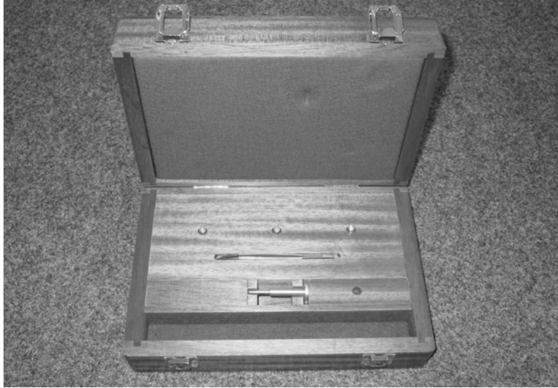
Figure1: Calibration kit: 3 magnets and a spacer in a wooden box with sufficient dimensions in order to ensure a magnetic field strength that is less than 200A/m outside the box

Redetermination of the vertical distances using one or more traceable susceptibility standards is supported by the included susceptometer software [6]. It is also possible to redetermine the magnetic dipole moment using the procedure described in [3]. The 3 additional magnets and the spacer are available from Sartorius as a so-called calibration kit (see figure 1).